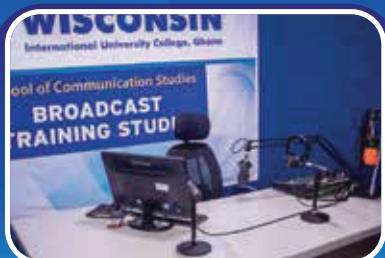
Broadcast Training Studio