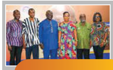
SIR SAM JONAH GRACES SCHOOL OF COMMUNICATION SEMINAR