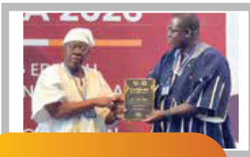
WISCONSIN CHANCELLOR NAMED AMONG AFRICA'S 100 MOST IMPACTFUL EDUCATION PERSONALITIES