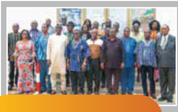
MINISTER OF EDUCATION, HON. HARUNA IDDRISU, TOURS WIUC- GHANA, COMMENDS INSTITUTION'S COMMITMENT TO PRACTICAL AND QUALITY EDUCATION