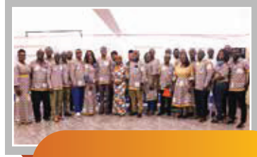
WISCONSIN MARKS 2026 CHANCELLOR'S DAY WITH WORSHIP & THANKSGIVING