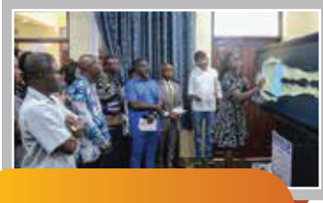
THE MINISTER OF HEALTH COMMISSIONS HD HIGH-DEFINITION ANATOMY TABLE AT WIUC- GHANA