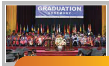
WIUC-GHANA GRADUATES 1,879 STUDENTS AS IT CELEBRATES 25 YEARS OF IMPACTFUL EDUCATION