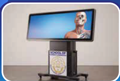
High Definition Anatomy Table