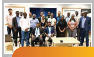
2025 FIRST & AFRICACERT SYMPOSIUM – WIUC-GHANA ON THE GLOBAL CYBERSECURITY STAGE, LEADING AFRICA INTO THE FUTURE.