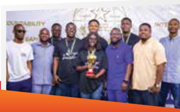
WINNERS OF MAIDEN HACKATHON COMPETITION FOR FINAL YEAR MSC CYBERSECURITY AND DIGITAL FORENSICS STUDENTS