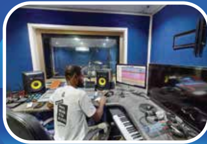
Recording Studio / Music School