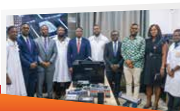
BANK OF GHANA KEY OFFICIALS VISIT WIUC-GHANA'S STATE-OF-THE-ART CYBERSECURITY & DIGITAL FORENSICS LABORATORY