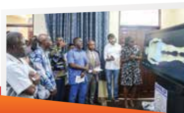
GHANA'S MINISTER OF HEALTH, HONORABLE KWABENA MANTAH AKANDOH LAUNCHES THE NURSING AND MIDWIFERY HIGH DEFINITION ANATOMY TABLE AT WIUC-GHANA

WASSCE Remedial Classes: Core Math's, English, Social Studies, Integrated Science and other subject areas available on campus.