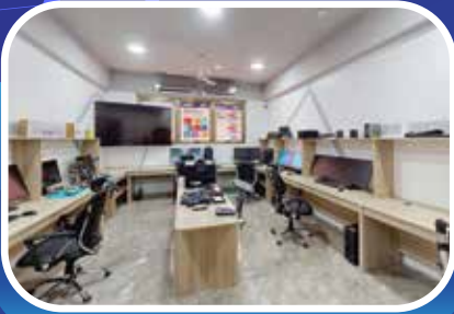
Cybersecurity and Digital Forensics Lab