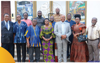
Visitation by key members of University of Iringa, Tanzania