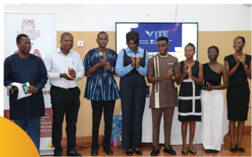
Wiuc - Ghana Business School Launch Students' Association