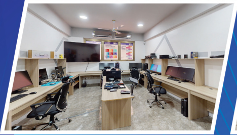
Cybersecurity and Digital Forensics Lab