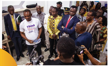
Cybersecurity, Digital Forensics and Ai Labs Commissioned