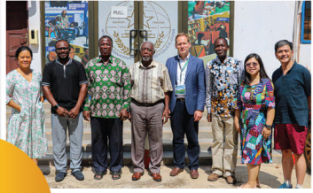
International Alumni Association of Bielefeld visits Wiuc - Ghana