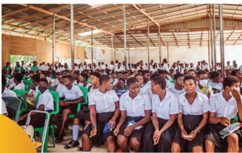
Career Counselling Seminar for Senior High Schools