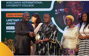
Ghana Business Awards Honours WIUC- Ghana Founder with lifetime Achievement Award