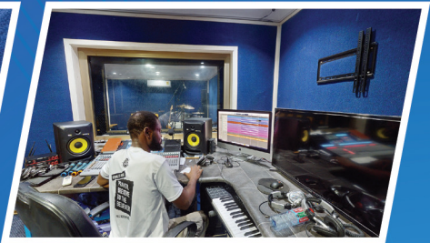
Recording Studio / Music School