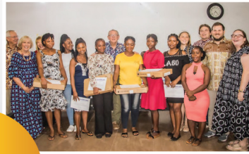
Ghana West Africa Medical Mission Awards Full Scholarship to Nursing Students